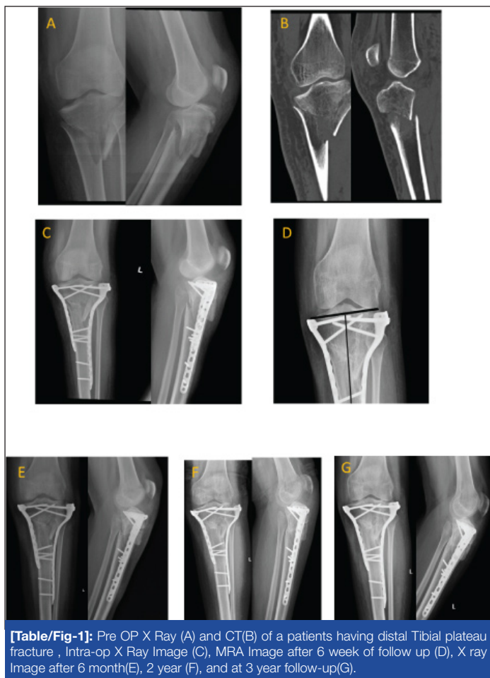
[Table/Fig-1]: Pre OP X Ray (A) and CT(B) of a patients having distal Tibial plateau fracture , Intra-op X Ray Image (C), MRA Image after 6 week of follow up (D), X ray Image after 6 month(E), 2 year (F), and at 3 year follow-up(G).